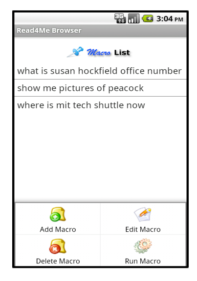
Figure 4: Macro Viewer