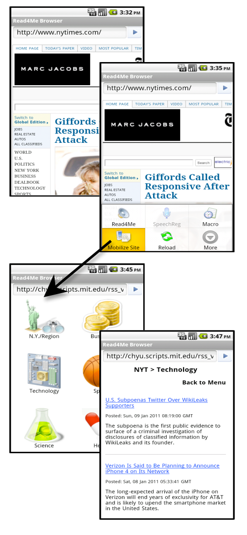
Figure 1: Mobilize NYTimes web site automatically by using "Mobilize Site" feature of the Read4Me

for mobile users, a survey was conducted to understand mobile users' experiences and opinions. This paper followed a user-centered design process similar to [11] and conducted a formative, pre-design evaluation on a sample of lead users. These users were randomly recruited on a college campus by asking people if they ever used a smartphone. The ones who had used smartphones and were willing to join the survey were the participants. 11 participants joined the survey. The participants' age rages are: 20-30 (64%), 30-40 (9%), 40-50 (9%), >50 (18%). 20 questions were asked in the survey and each survey took about 30-45 minutes. There were 7 males and 4 females and all of them had experience using a smart phone, a mobile web browser and mobile applications.